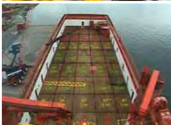
Top left: DMM/Camera seen from crane cabin